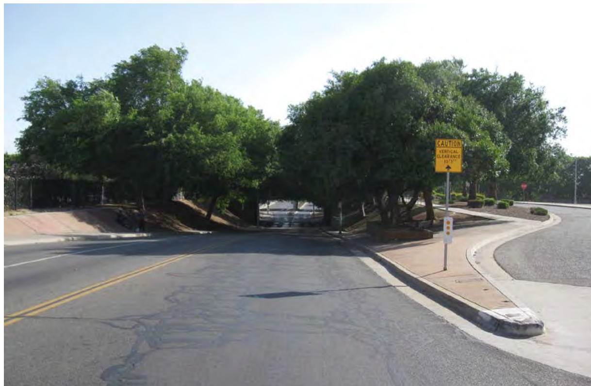
Existing: View looking Southwest on Fresno Street toward the H Street overpass.

Recommendations: provide generous at-grade sidewalks and underpasses for pedestrian and bicyclists; if possible, bring Fresno Street to grade at H Street and eliminate the below grade underpass that previously came to grade at Broadway; this reduces the commercial frontage flanked by undercrossing approaches.