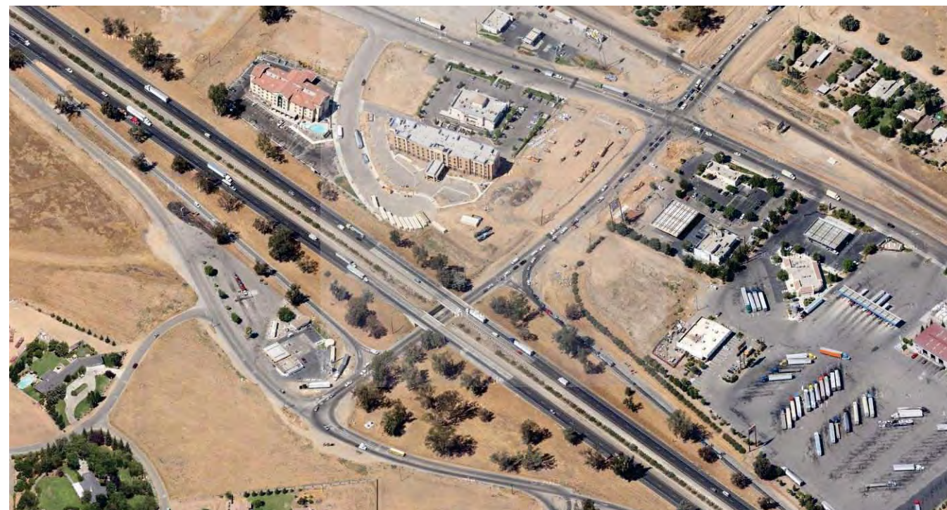
Existing: Aerial photo of Herndon Avenue intersecting SR99 and Golden State Blvd.