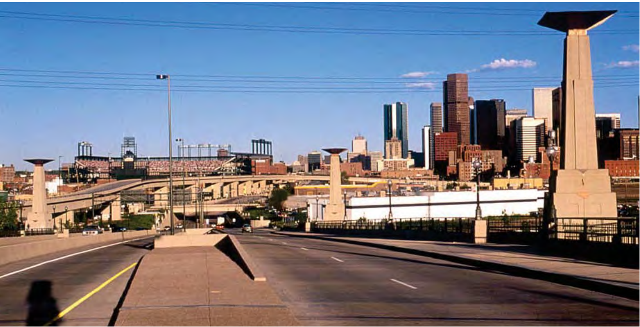
Example: Overcrossing into Denver, with pedestrian pathways and gateway features.