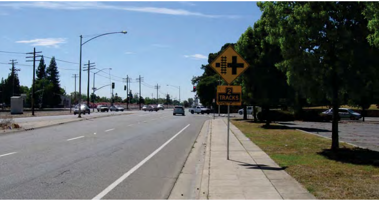
Existing: View looking Southeast on Golden State Boulevard toward intersection with Olive Avenue, with UPRR ROW at left and Roeding Park at right