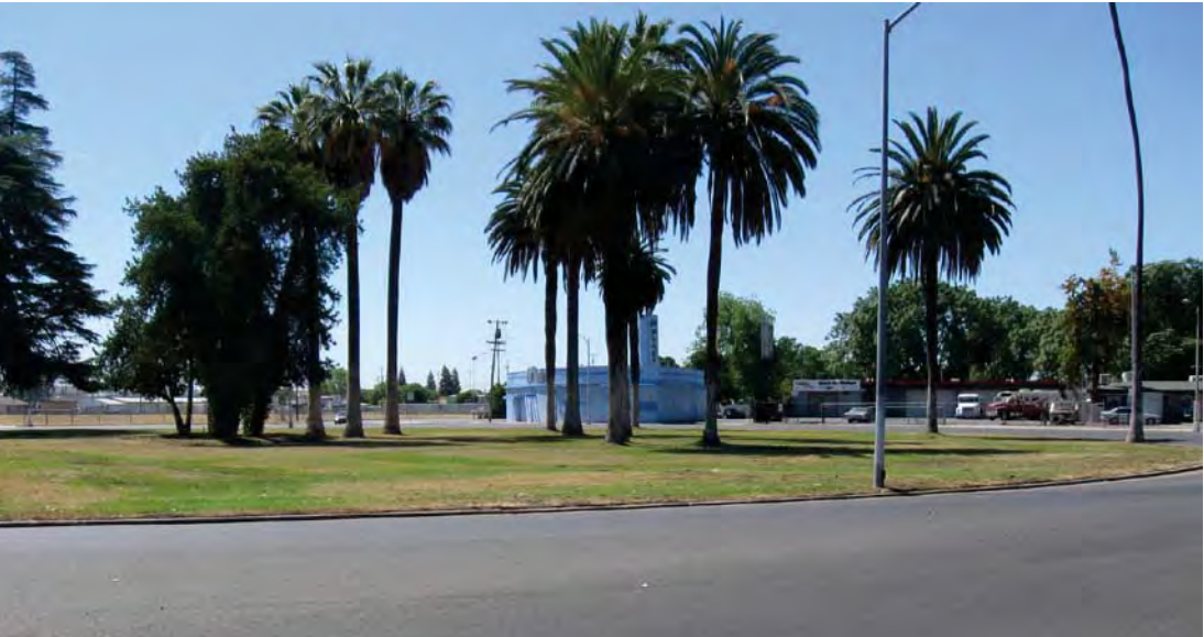
Existing: View of traffic circle where Golden State Boulevard meets Belmont Avenue

Recommendations: visual changes to the park can be made acceptable through carefully placed additional landscaping including the planting of tightly spaced trees to create a linear grove and a green visual barrier along the entire eastern edge of the park from Olive Avenue to the triangle of land given back to the park by the removal of the roundabout at the abandoned alignment of Golden Gate Blvd. and Belmont Avenue.