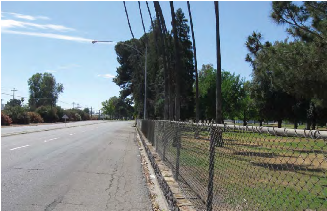
Existing: View of Golden State edge of Roeding Park